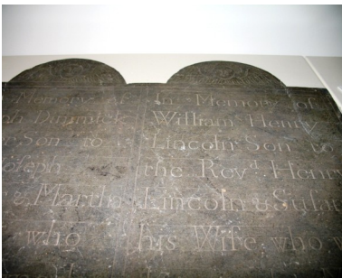
The boys' double gravestone is here at the Museums on the Green.