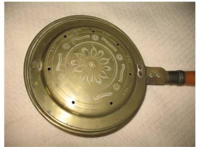
Nineteenth century bedwarmer, on display at Wicks House, with detail of its decorative cover.