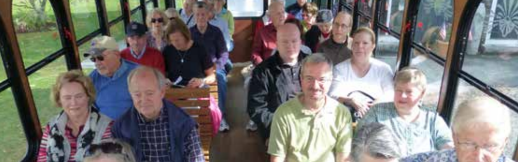
2014 Annual Report