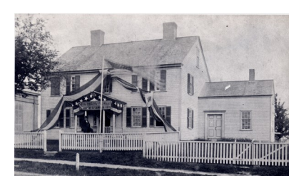
The Silas Jones/Harriet Burrill House (Elm Arch Inn), ca. 1900, before it was moved from Main St. to Elm Arch Way.

He knew every boy in town. He had helped every boy to make a kite, or rig a boat, or make a woodchuck trap, or had showed him a good place to set traps for rabbits. Baalis knew everything. The boys did not realize this till they had thoroughly tested him. Did you ever see a ropeyarn gun? It is made of an empty tin can and a piece of tin tube, the whole tightly wound with ropeyarn till it makes a round ball twice as big as your head. Through the tube the can is filled with powder and fired with a fuse. It makes a great noise when it explodes but is quite harmless if only you dodge the can. One or more of these things the boys made in secret each year to disturb the sleep of